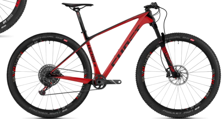
Lector WC.9, 10.9, 9.9 (MY18)